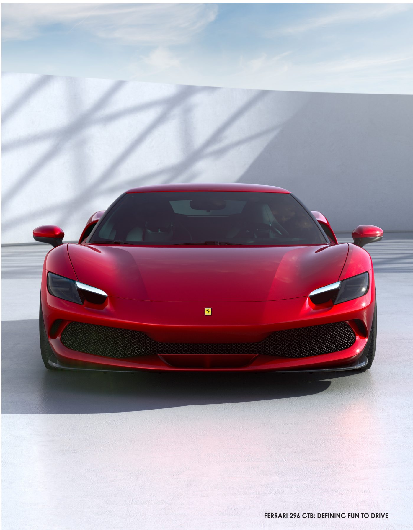
FERRARI 296 GTB: DEFINING FUN TO DRIVE

The Business Magazine of the Thai - Italian Chamber of Commerce