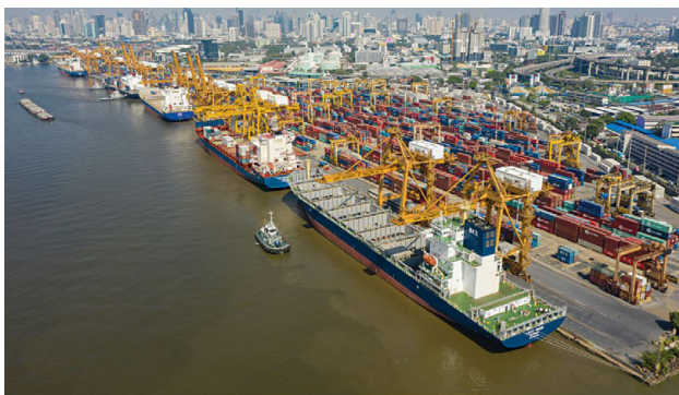
BECOMING WORLD CLASS: PAT'S GREEN PORT PROJECT

8 THAILAND BOI APPROVES ENHANCED INCENTIVES TO PROMOTE R&D AND HRD