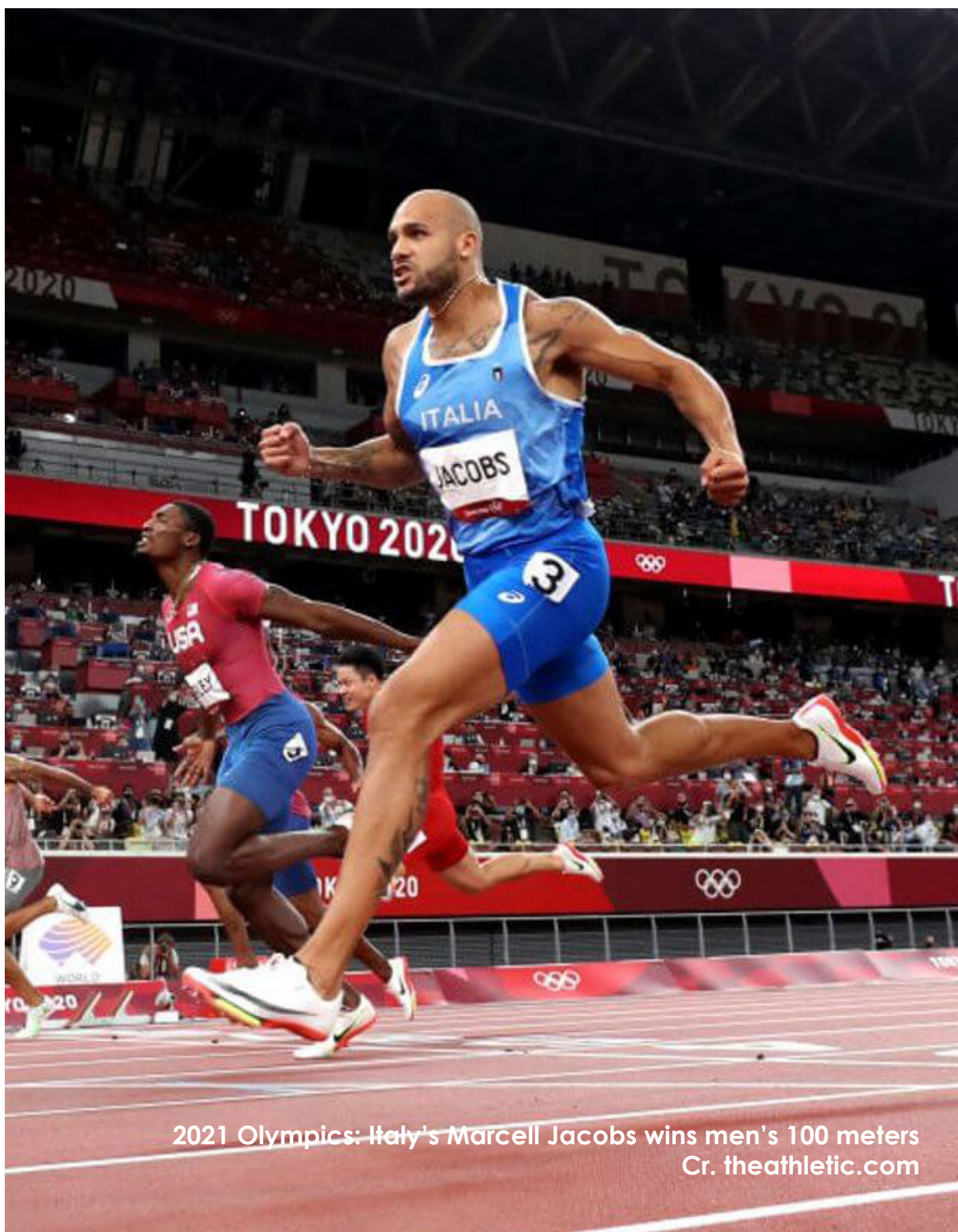
2021 Olympics: Italy's Marcell Jacobs wins men's 100 meters

The Business Magazine of the Thai - Italian Chamber of Commerce